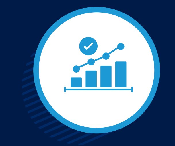
No need for lengthy Al training—boost productivity with ready-to-use tools.